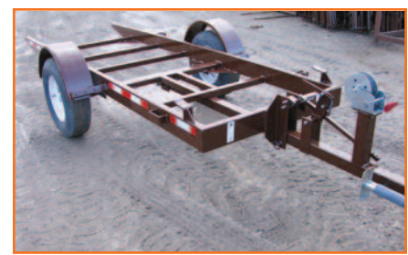
Hydraulic Transport Kit